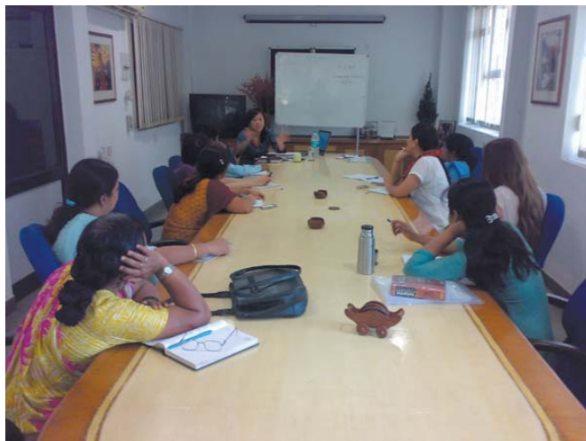
Workshop on “Protection of women from Domestic Violence Act”

As part of the project, the CSR team is currently working on the Training of Trainers Manual to facilitate capacity building of the participants in question apart from working on the logistics of