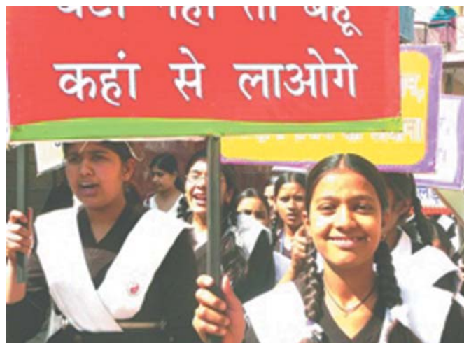
School girls in Najafgarh participating in rally

Our first walk in Najafgarh on 27th February 2008 was truly exemplary of CSR's vision, as girls and boys, youth and elderly, rallied together, banners upheld, shouting in unison "Ladka, Ladki