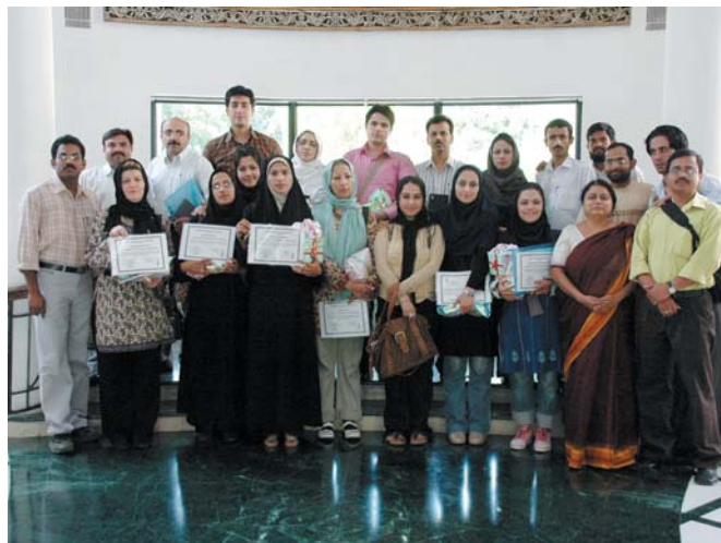
16 Iranian interns

The Centre for Social Research and the Academy for Educational Development (AED) jointly organized the Internship Connections Programme from 25th March to 19 April 2008. The program aimed to increase mutual understanding and capacity building of young