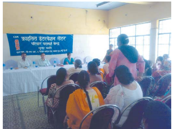
CIC Interface Programme

During the first quarter of 2008 apart from the regular activities like community meetings, Awareness Generation Programmes (AGP) and case handling, two interface programmes with stakeholders from the police, community based organizations and other NGO's were organized at CIC Daya Basti and Sunder Nagri on 15.04.08 and 24.04.08 respectively. Through these interface programmes we have been working towards creating a supportive environment so that victims of violence can approach the support agencies without any apprehension or anxiety. The agenda of the programme was "Protection of