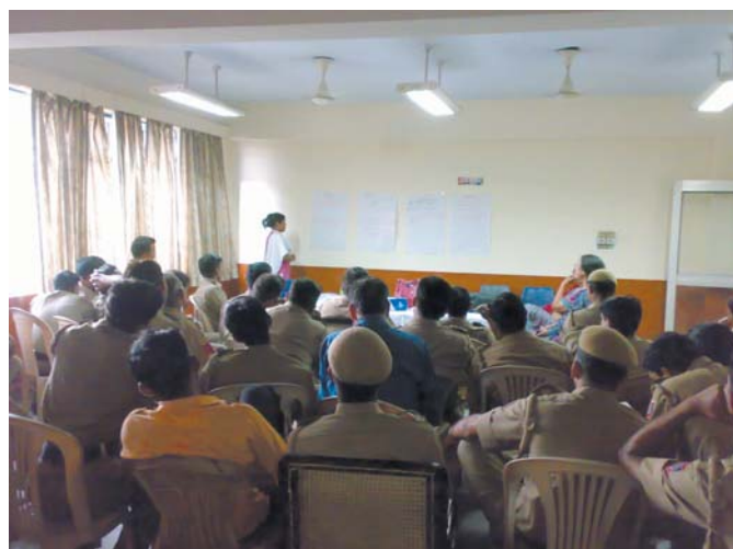
Gender Sensitization Workshop at Police Station

In addition to the on-going trainings that the Delhi Police is imparting to its personnel, building competencies of its staff on gender issues is of utmost importance in the context of changing social dynamics with more and more women coming into the work force and also